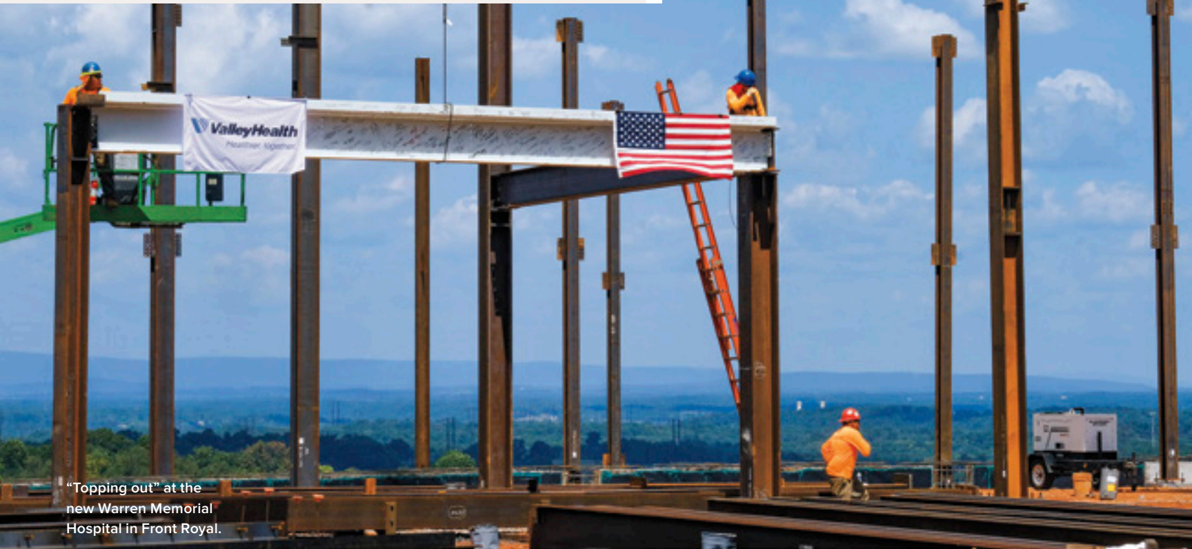
“Topping out” at the new Warren Memorial Hospital in Front Royal.